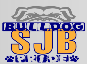
Design 6 - Can go on White or Ash Tees