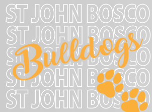
Design 4 - Navy Tee