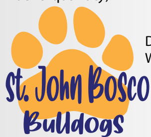
Design 3 - for White or Ash Tee