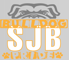
Design 6 - Can go on Navy Tee